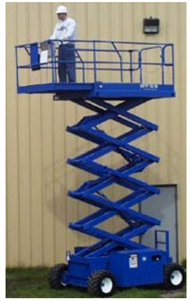
Mobile scissor lift