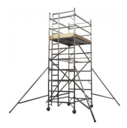
Mobile tower scaffold